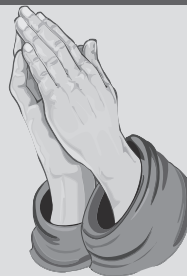
Table of Ester

Please pray for our new Rectors as they devote so much of their time and talents preparing for this special weekend.